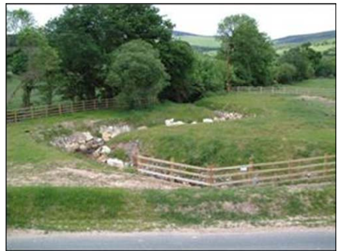
Extreme meanders installed during excavation of a new channel to overcome excessive gradient between the original course of the stream (in the background at tree line) and the point of entry of the newly created channel to a culvert (in foreground under the timber fencing). In this instance there was inadequate provision at the planning and design stage for the necessary land take.

9.5 In newly constructed by-pass channels the process of diverting waters and associated movement of fish stocks may only take place under the direction and supervision of IFI or its agents. Adequate advance notice of all such proposed works shall be given to IFI.