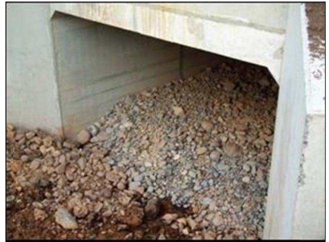
Off-line culvert at construction stage back filled with gravel. The size range and depth of fill required will be site specific.

6.9 Culverts should be positioned where the watercourse is straightest and aligned with its bed.