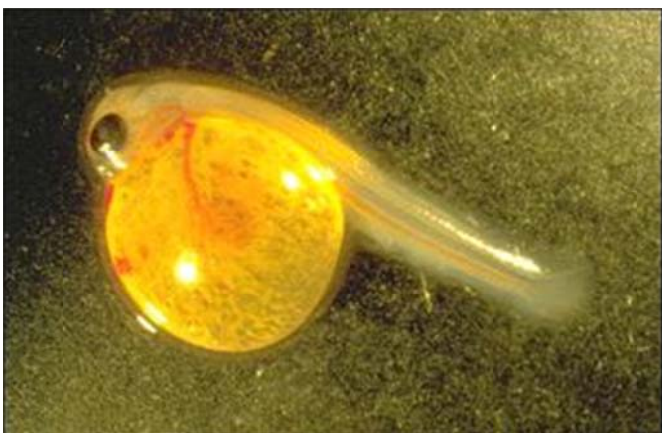
A brown trout at the alevin stage shortly after hatching. This life stage is very sensitive to pollution and physical disturbance.

1.2 IFI policy is aimed at maintaining a sustainable fisheries resource through preserving the productive capacity of fish habitat by avoiding habitat loss, and harmful alteration to habitat. Construction works particularly those entailing the installation of new river and stream crossing structures and the realignment of river channels have the potential to significantly impact both in the short and long term on fisheries resources if they are not carried out in an environmentally sensitive manner.