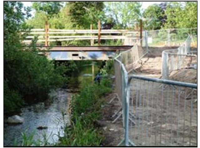
Temporary clear span 'bailey bridge' ensuring free upstream and downstream movement of aquatic life. The streamside fencing should be 5 metres from the watercourse, not immediately alongside as in this photograph.