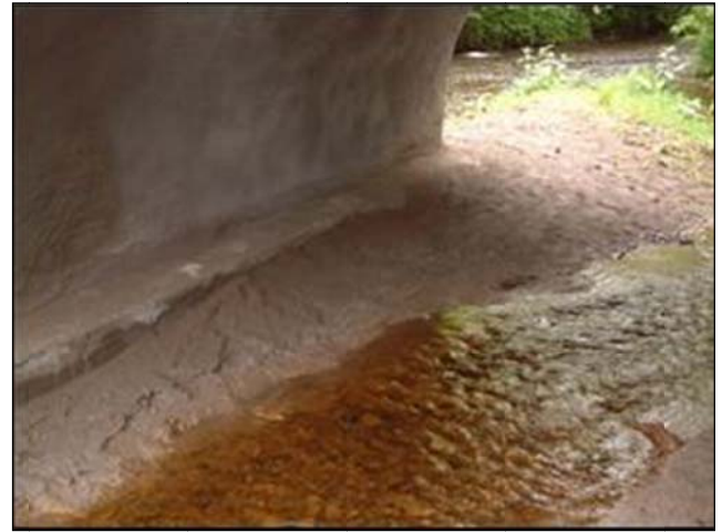
Gunite rebound on a stream bed where no precautions were taken to prevent its entry to waters. Rebound having a pH >11.5 would have entered the actively flowing stream with dire environmental consequences.

10.5 Where a single arch structure is under repair, to achieve grouting in the dry, water may be diverted from upstream to downstream by means of a secure flume arrangement, or through piping, or in very limited circumstances, by means of over pumping. Screening to preclude entry of aquatic life to pumps must be carried out.