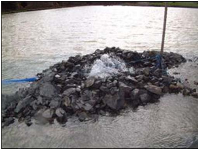
Silt control pond. The blue hose conveying pumped silt laden waters has its outlet securely anchored within the stone aggregate thereby dissipating energy, minimising disturbance, and preventing pond contents being disturbed and re-suspended.

and rivers) for a period sufficient to ensure no leachate from the concrete.