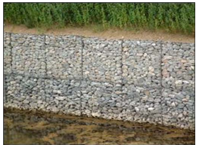
Visually unsightly stone filled gabion baskets.

6.15 The height to which rock armour is built must take account not only of the riparian zone requiring protection, but also in certain circumstances of the need to protect e.g. kingfisher and sand martin habitat. In many instances, one or two layers of armour will be sufficient to protect and stabilise the toe of embankments while allowing nesting.