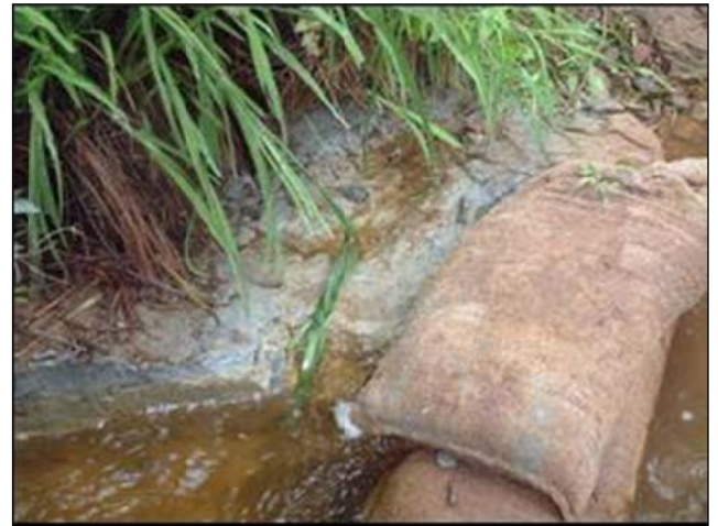
Grout loss to waters is normally stopped by placing dry cement over the leak, with sand bags on top to restrict grout flow until the leak solidifies. (This photograph was taken after water flow was re-established following solidification of the grout.)

repair works. The most commonly used methods for such works include pressure grouting, guniting and pointing of joints