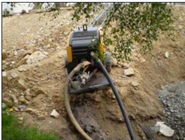
Drip tray is undersized, dangerously positioned and leaking oil. Unacceptable practice.