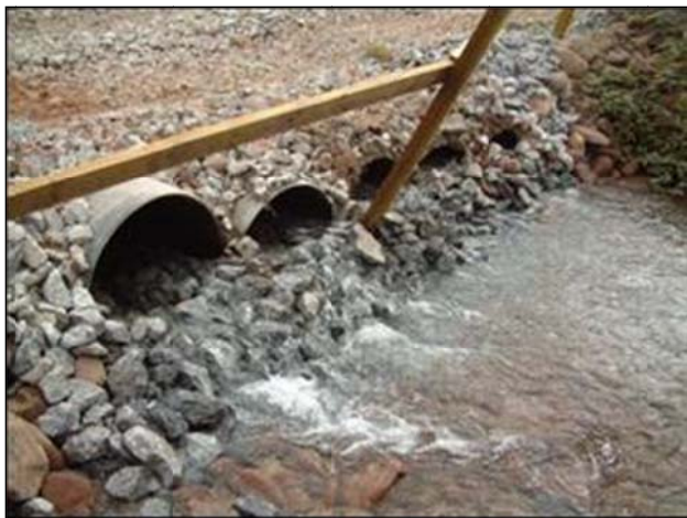
Temporary crossing impassable to fish life.