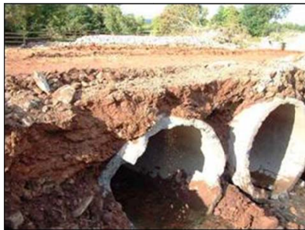
Temporary crossing structure. Impassable for aquatic life and emitting silt to waters as construction equipment traverses the crossing. Unacceptable practice.

5.1 All watercourses which have to be traversed during construction projects should be effectively bridged prior to commencement of works. There is sometimes a serious misconception that in installing temporary crossing structures, the only issue is keeping water flowing from above a temporary crossing to below it. Design and choice of temporary crossing structures must provide for passage of fish and macroinvertebrates, the requirement to protect important fish habitats e.g. spawning and over wintering areas, as well as preventing erosion and sedimentation. In certain circumstances, access for angling or commercial fishing purposes may also be required.