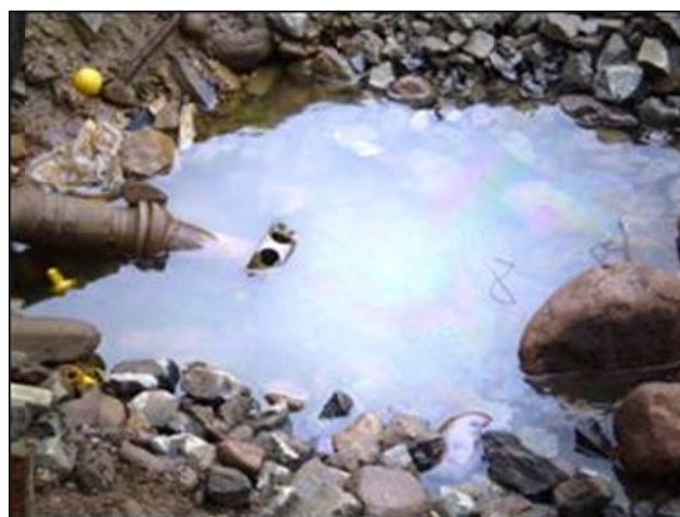
It is a serious offence to discharge deleterious matter such as oil contaminated residues to waters.

Further information on invasive species their impact and control, and on bio-security is available at www.inlandfisheriesireland.ie