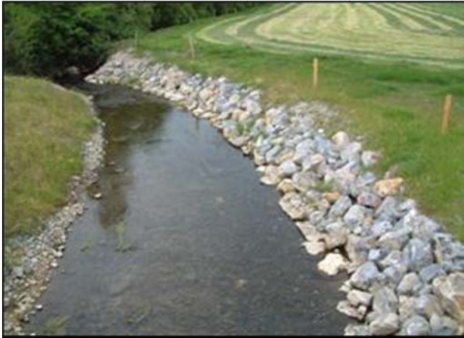
The boulders in these bank protection works are not large enough, not sunken below stream bed level and likely to be undercut and dislodged in a storm event.

level and securing them into their final position. In areas of high water energy, to ensure stability, boulders size should be a minimum of 0.5 ton.