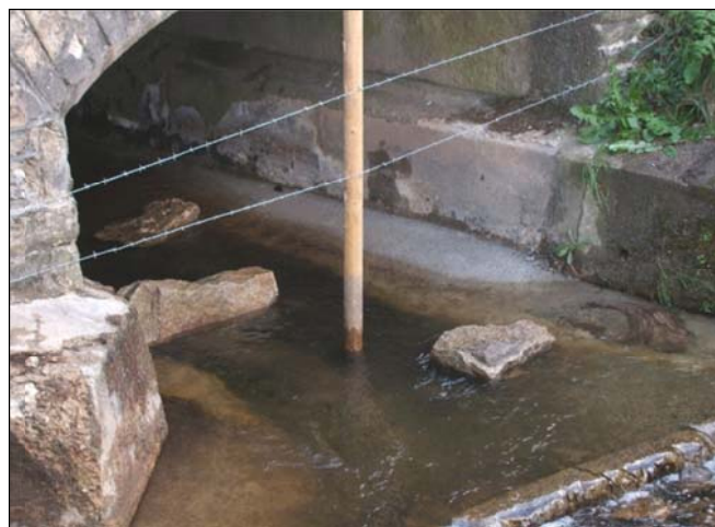
Large stone baffles held in position on concrete apron with stainless steel dowel rods drilled into both the apron and stones. (Poor placement of the livestock fencing as shown in the photograph has the potential to cause blockage by catching debris.)

10.12 The installation of baffles can assist where excessive water velocity over an apron/scour slab prohibits free upstream fish movement. Baffles should be positioned so as to reduce velocity and provide temporary rest areas for weaker fish attempting to swim upstream.