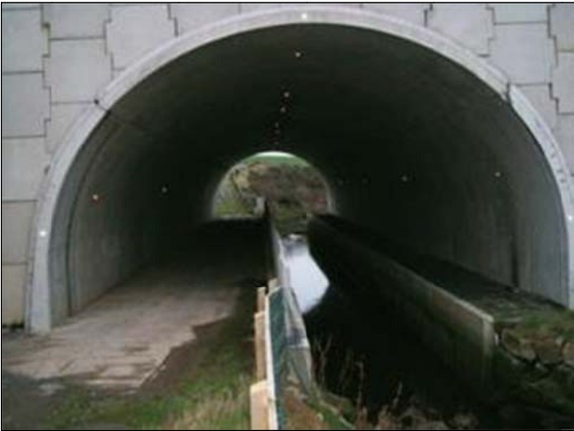
A tidal water with access for vehicles and on the opposite side, access for anglers.