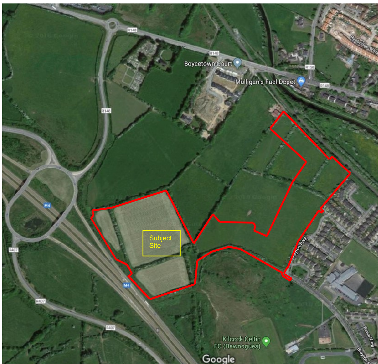
FIGURE 1 - Site Location