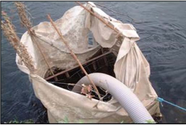
A screened abstraction point using terram fitted over a fabricated support frame.