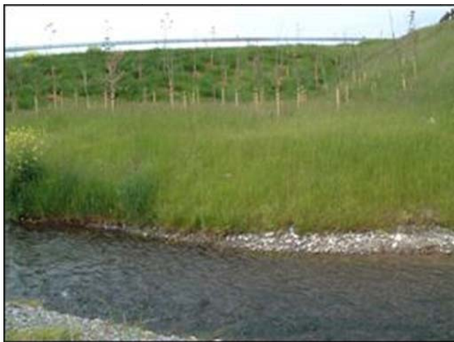
Well vegetated newly established river channel, with broadleaves planted to within 5 meters of the overflow channel. The root structures aid bankside stability.

9.13 Newly constructed river and stream channels shall have banks battered to a finished angle of not greater than 45° on one bank and not greater than 30° on the opposite bank, (to allow for maintenance of a low flow channel, an overflow and a flood flow channel). Banks shall be top soiled and seeded so as to ensure the growth and development of a broad range of local grasses and shrubs thereby facilitating development of stable bank root structures.