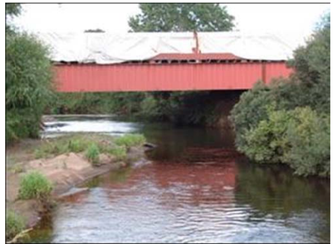
A clear span temporary crossing capable of carrying heavy axle loadings and long wheel base vehicles.

5.3 The preferred option is for clear span 'bridge type' structures on fisheries waters.