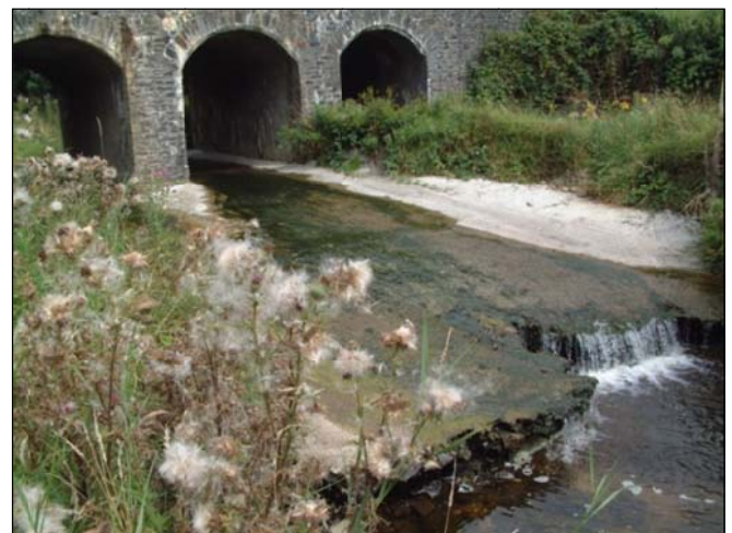
Apron/scour slab inaccessible on its downstream end to fish life because of the extent of perching and impassable due to a combination of excessive water velocity and lack of water depth across its surface.

10.6 In all instances of guniting and repair works including repointing and masonry cleaning, the entirety of the area of water over which works are taking place should be protected from gunite rebound, mortar and vegetation loss by installation of a sealed and secure decking which shall extend upstream and downstream the structure concerned so as to ensure no losses to water.