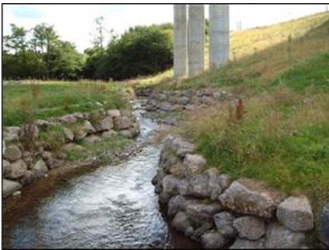
Suitably sized rock armour built to high water level at a location influenced by tidal back-up.

6.14 To facilitate revegetation, each course of boulders laid should be back filled with a layer of top soil. Selection of boulders in terms of shape to facilitate their placement and stability is a major consideration. Irregularly shaped boulders are very difficult to work with in terms of building multiple stable courses.