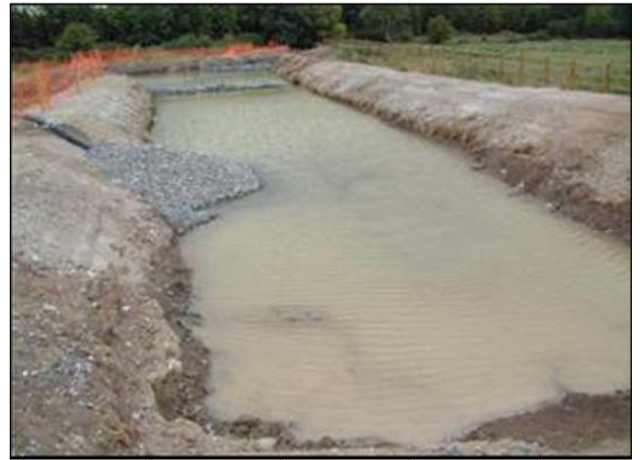
Silt control pond. Note hose conveying pumped silt laden waters with its outlet positioned within the gravel mound thus ensuring no disturbance of pond contents.