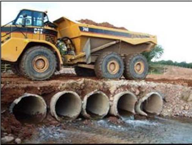
The same temporary crossing location as shown on the previous page, but with a laden dumper dislodging and causing loss of cover material to waters.