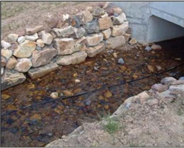
An embedded box culvert sized to match existing stream profile.

6.7 Clear span designs maintain channel profile, do not alter gradients, readily pass sediment and debris and provide unrestricted passage for all size classes of fish by retaining the natural stream bed and gradient. Water velocity is not changed and they can be designed to maintain the normal stream width. Foundations should be positioned at least 2.5 metres from waters.