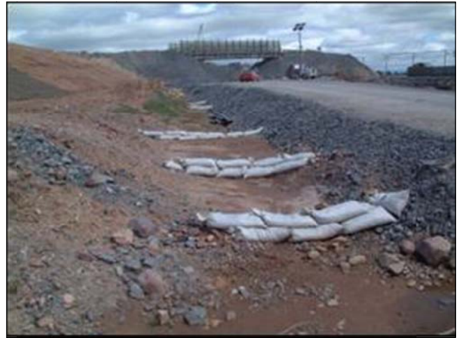
Silt discharge minimisation by providing retention areas to reduce discharge velocity and allow settlement during rainfall events.

7.2 Discharge of silt-laden waters to fisheries streams is of particular concern. Silt can clog fish spawning beds and juvenile fish species are particularly sensitive. Plant and macroinvertebrate communities can literally be blanketed over, and this can lead to loss or degradation of valuable habitat. It is important to incorporate best practices into construction methods to minimise discharges of silt/suspended solids to waters.