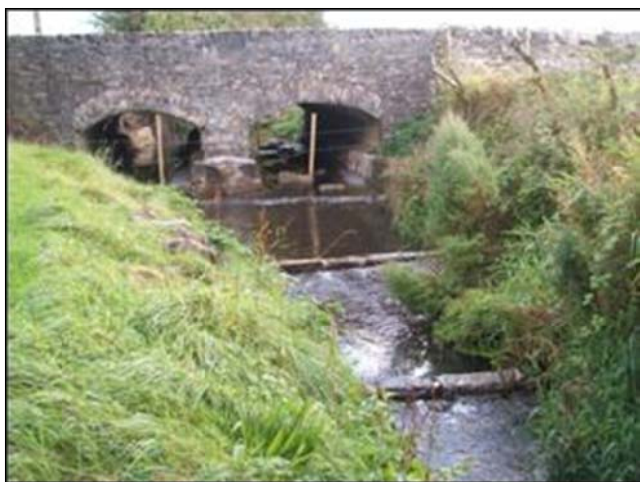
Low level stone weirs installed on a salmonid nursery stream to back water the bridge apron /scour slab originally installed at too high a level.

10.8 Repairs to bridge aprons/scour slabs must be undertaken so as to ensure upstream and downstream passage of fish is possible in all flow conditions. Particular care must be exercised to ensure perching does not result where new concrete slabs are poured.