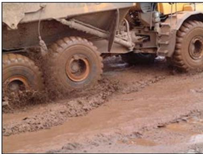
Construction sites require careful management. Is this the optimal haul route in terms of impact minimisation?

7.3 Discharges of fuels and oils can be directly toxic to aquatic life and at sub lethal levels lead to tainting of fish tissues, rendering fish inedible. Oil films on water can seriously interfere with the diffusion of oxygen from the atmosphere into waters and in extreme cases result in oxygen depletion.