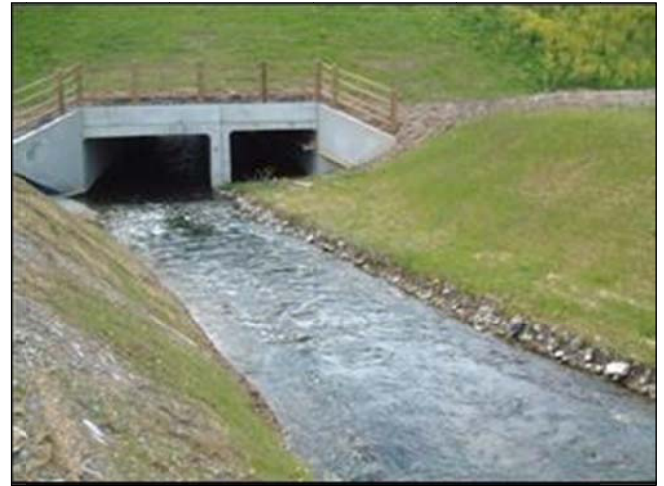
Looking from upstream towards a culvert arrangement. Moderate and flood flows are conveyed in the right hand culvert. Entry to that culvert is dictated by the invert and contour of the right hand portion of the newly created river channel. The left hand bank finished batter angle is approx. 45°. The first portion of the right hand bank to convey the moderate flow is battered to approx. 30°. The extreme right bank area is battered to approx. 45° to convey flood flows.

9.14 Broadleaves shall, where prescribed by IFI, be planted along newly created channels so as to provide a mixture of dapple and shade conditions. Planting shall be a minimum of 5 meters from the watercourse channel.