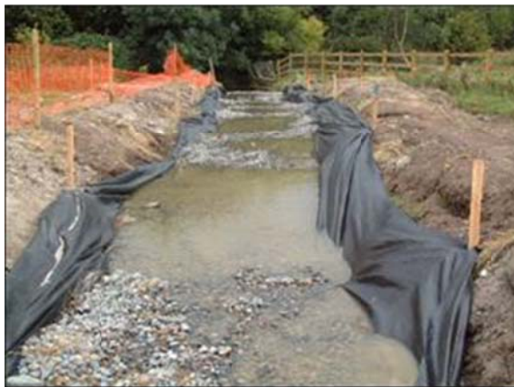
Terram lined (to prevent erosion) silt control pond outlet channel showing gravel acting as filter medium for silt removal.

7.4.12 Hydroseeding shall not be carried out in close proximity to water. These areas shall be seeded by hand.