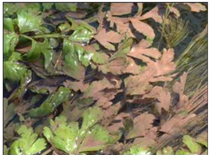
The practical impact of poor silt control.