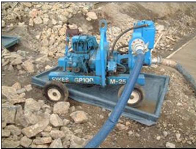
Poor work practice. The drip tray is undersized, constructed of too light a material, and accordingly overly flexible, easily damaged, and unlikely to retain oil residues.

7.4.2 No direct discharges be made to waters where there is potential for cement or residues in discharges.