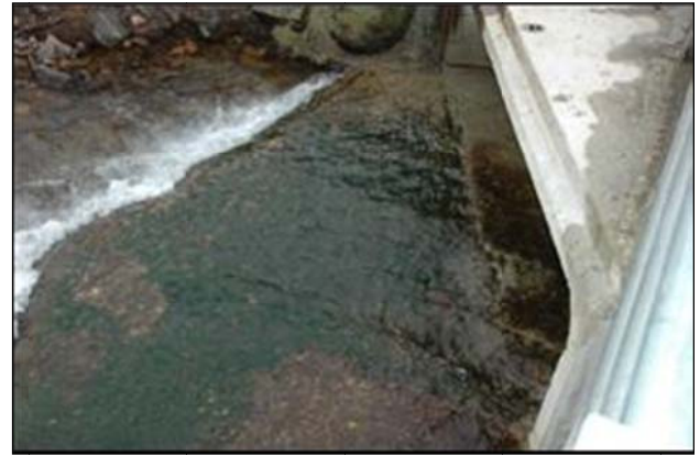
The smooth concrete finish is totally unsuitable for fish passage.

6.11.3 In the case of box culverts on angling waters, be 3 meters in height.