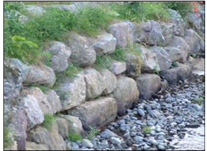
Revegetation of rock armour facilitated by the placing of locally sourced topsoil (to ensure no importation of non local grasses and shrubs) between each layer or course of boulders at installation time.

6.14 To facilitate revegetation, each course of boulders laid should be back filled with a layer of top soil. Selection of boulders in terms of shape to facilitate their placement and stability is a major consideration. Irregularly shaped boulders are very difficult to work with in terms of building multiple stable courses.