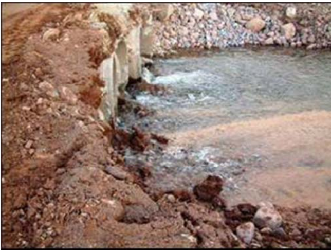
The inevitable result from the crossing shown above. Continuous silt discharges. Unacceptable practice.