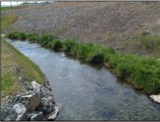
Newly created channel. The riparian grasses on the right bank have been transferred from the previous course of the now redundant original channel. The root structures stabilise the bank area while the grasses provide a degree of cover and shade and provide habitat for aquatic insects which form part of the food for fish.

9.17 In the case of newly created stream and river channels IFI require that: