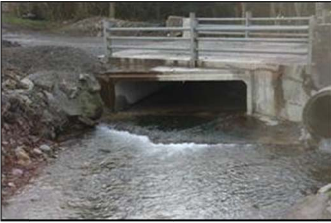
Box culvert positioned at incorrect level. Upstream fish passage is made difficult. Culvert invert should be 500 mm. below existing bed level and back filled with clean gravel to match the existing stream profile.

6.11 While the preferred option is for bottomless culverts, IFI is prepared in certain circumstances to consider proposals for the installation of box or pipe culverts on fisheries waters. These may be installed subject to structures being sized so as to meet the requirements at 6.10 in terms of channel profile, gradient, flood debris capacity, light, access and: