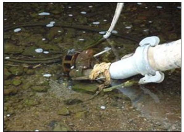
Continuous abstraction using submersible pump. No screening in place to prevent the entry of e.g. juvenile fish species to the pump. Unacceptable practice.

persons and property, that dust control measures sometimes may be required. This is normally achieved by abstraction from watercourses adjacent to the site of earthworks. In such circumstances it is essential that the aquatic resource is protected and that over-abstraction does not take place especially in low flow summer conditions at locations supporting important fish populations.