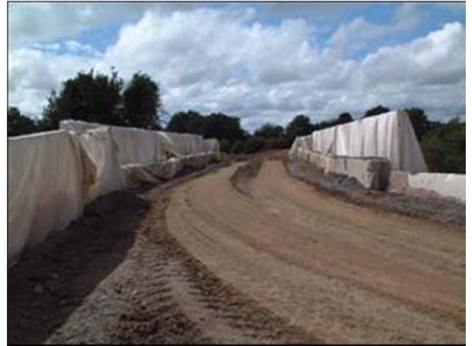
A crossing structure over a designated salmonid water. Note: terram covered fencing, reinforced concrete traffic barriers and fall back from the watercourse.

5.10 IFI wish to emphasise that site selection for temporary crossings should have regard to all access and construction needs ranging from those of fencing contractors vehicles to the longest wheelbase of multi-axle cranes.