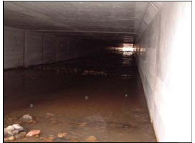
Excessively long culvert resulting in habitat loss and reduced productivity due to inadequate light penetration.

6.3 Bridge foundations should be designed and positioned at least 2.5 metres from the river bank so as not to impact on the riparian habitat.