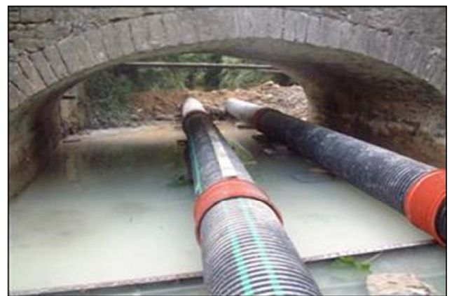
Repairs to a single arch bridge and scour slab with stream flow piped from upstream to downstream (foreground) during both grouting and slab repair.

10.2 The concerns as regards sensitivity of aquatic life to pollutants and physical disturbance set out earlier in this document all apply, particularly as regards loss of grout and gunite rebound, both of which are highly alkaline.