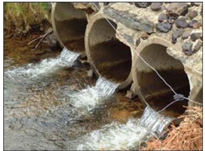
Unacceptable culverting practice. These pipes are totally impassable to fish.

6.12 Pipe culverts are not generally considered acceptable on fisheries waters. They are normally only appropriate for use on minor watercourses and drainage ditches where these can be demonstrated as not being significant in terms of fisheries habitat.