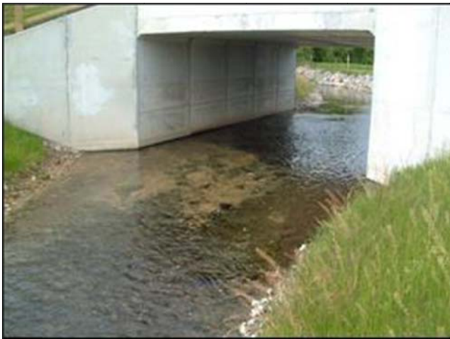
Excessively wide culverts can result in reduced current speed, ponding, and siltation of instream gravels.

6.2 Culverts are the most frequently used river/stream crossing structures and are associated with some of the most common fish passage problems. The culverting of long stretches of fisheries water is extremely undesirable and can result in significant loss of valuable habitat. In the case of crossing structures over fishery waters, the preferred position is for clear span structures (bridges), so as not to interfere in any way with the bed or bank of the watercourses in question.