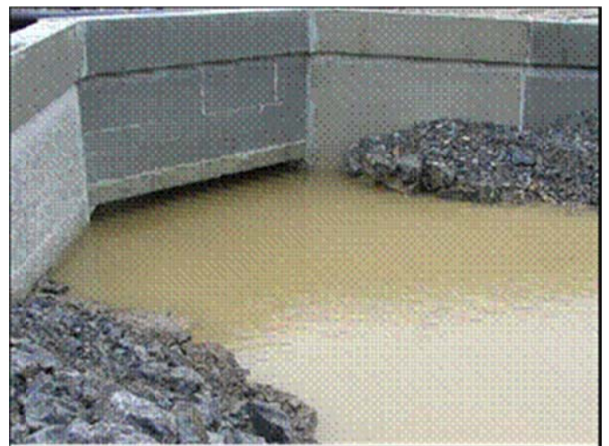
Is the culvert adequately sized?

6.1 Structures should not damage fish habitat or create blockages to fish and macroinvertebrate passage. Design and choice of structure should be based on its technical